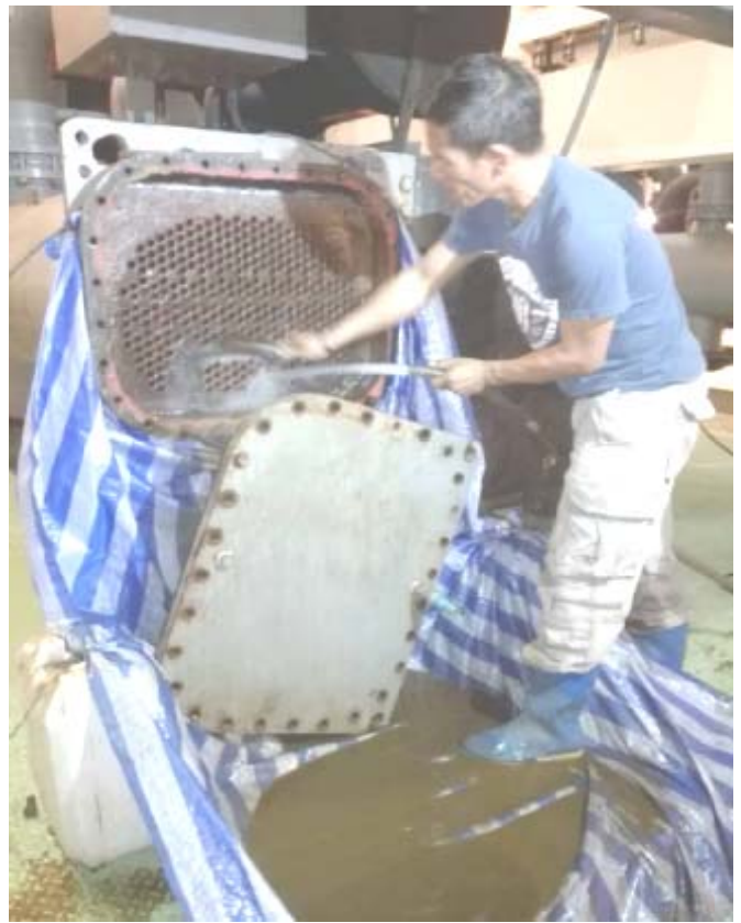
CLEANING SURFACE CONDENSER TUBE WITHIN CONDENSER LID