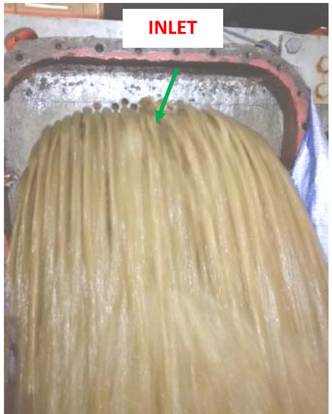
FLUSHING CONDENSER TUBE AFTER CLEAN SUCESSFULLY