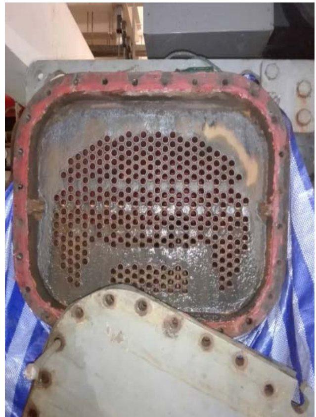
CLEAN CONDENSER TUBE BY NYLON BRUSH AND MACHINE SPIN