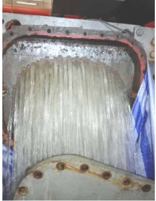
FLUSHING CONDENSER TUBE AFTER CLEAN SUCESSFULLY