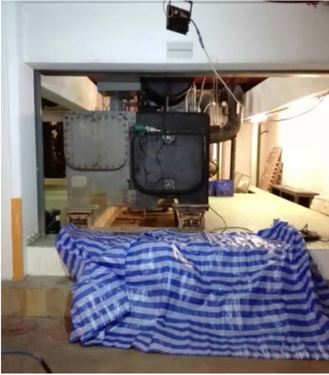
PREPARE OPEN CONDENSER LID