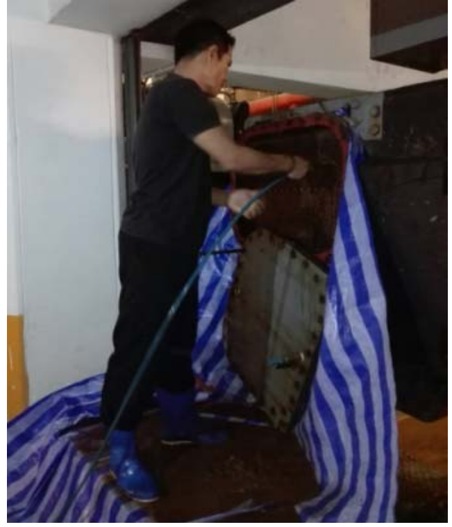
CLEAN CONDENSER TUBE BY NYLON BRUSH