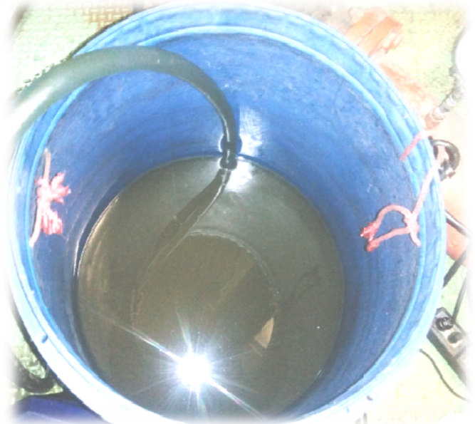
CIRCULATE CHEMICAL FOR CLEAN CONDENSER TUBE BY DG-2317 SOLUTION