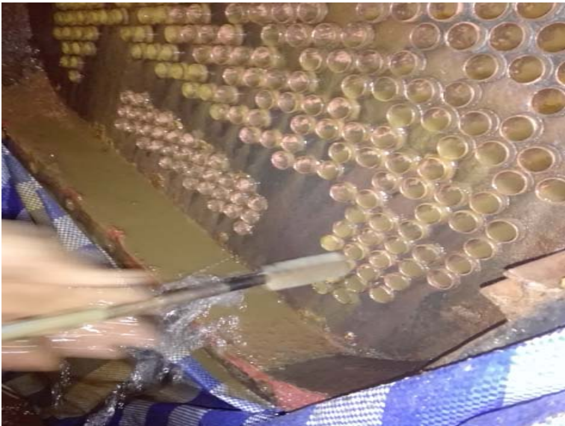
CLEANING CONDENSER TUBE BY MACHINE SPIN AND NYLON BRUSH